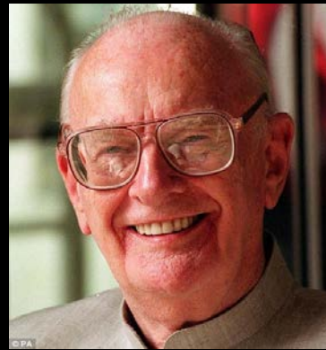
Electronic World Brain Arthur C. Clarke (1962)

Catalogue all information (World Encyclopedia), use it to make best decisions