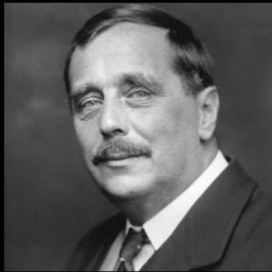
World Brain H.G. Wells (1936)

Catalogue all information (World Encyclopedia), use it to make best decisions